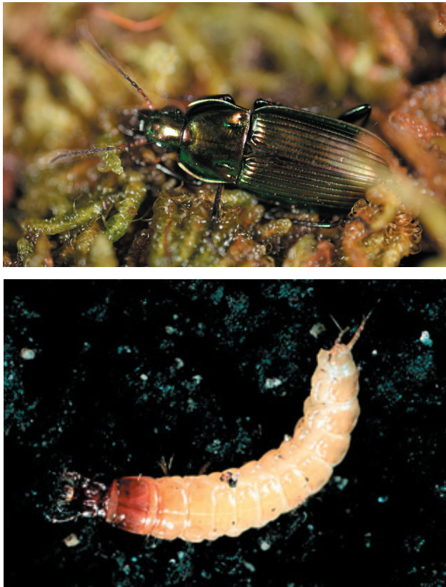
Fig. 1. Poecilus chalcites adult and larva.

ride) (0.6%), sorbic acid (0.4%), and tetracycline (0.2%). For egg production, adults of P. chalcites were maintained in glass jars containing moist soil with high levels of clay; female beetles readily laid eggs directly into the soil.